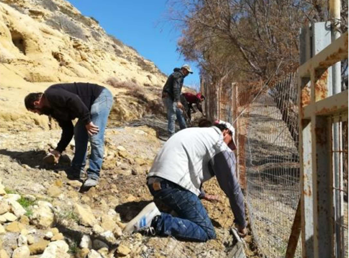
Invasive species, Carpobrotus eduliis & its removal