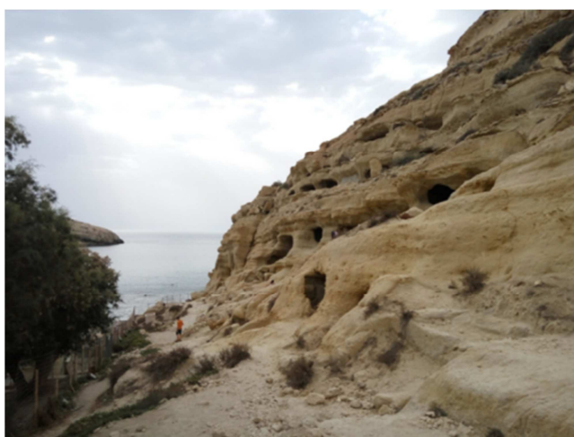
Limonium creticum plant, inflorescence & habitat