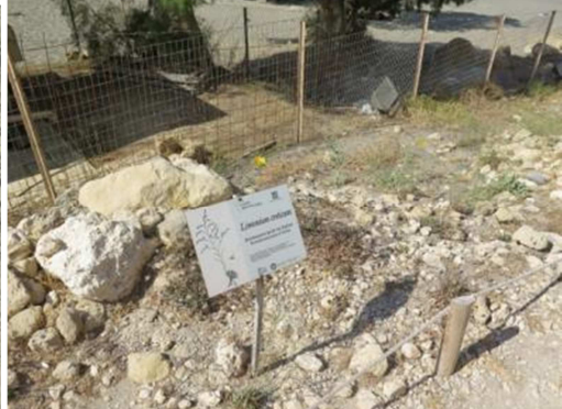
Limonium creticum seedlings to be planted; L. creticum established new plant; Information sign and light fencing