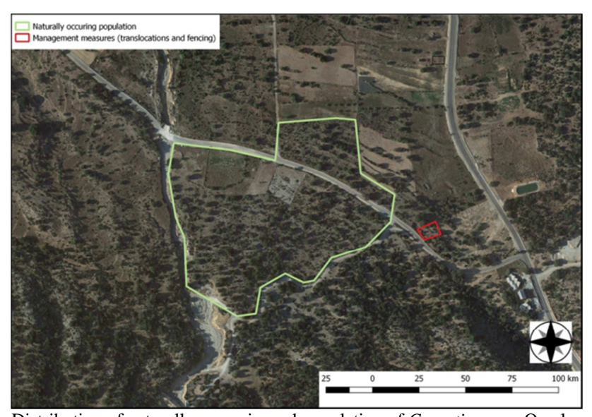
Distribution of naturally occurring subpopulation of C. creticum on Omalos plateau, in West Crete, and translocation area.