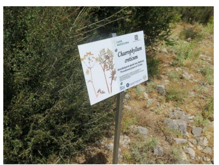
Pots planted with C. creticum mericarps covered with protective structure; Information sign at the site of the translocation