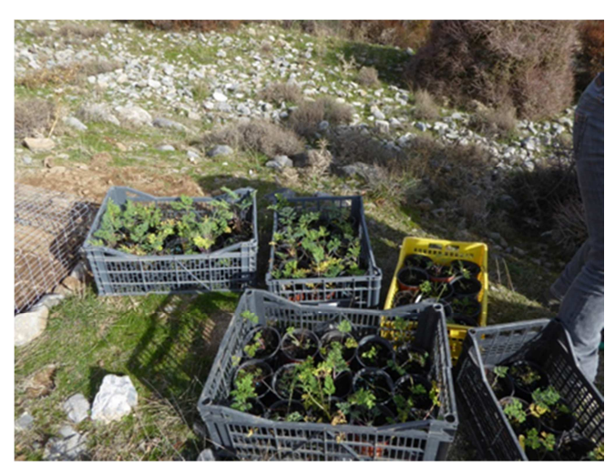
Chaerophyllum creticum in flowering; C. creticum seedlings ready to be planted