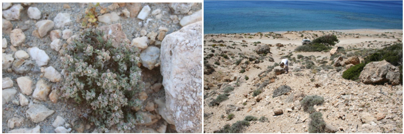
Bolanthus creutzburgii subsp. zaffranii at flowering stage & The area of Gialiskari (next to Palaiochora at the Southwest of Crete), where reinforcement actions took place.