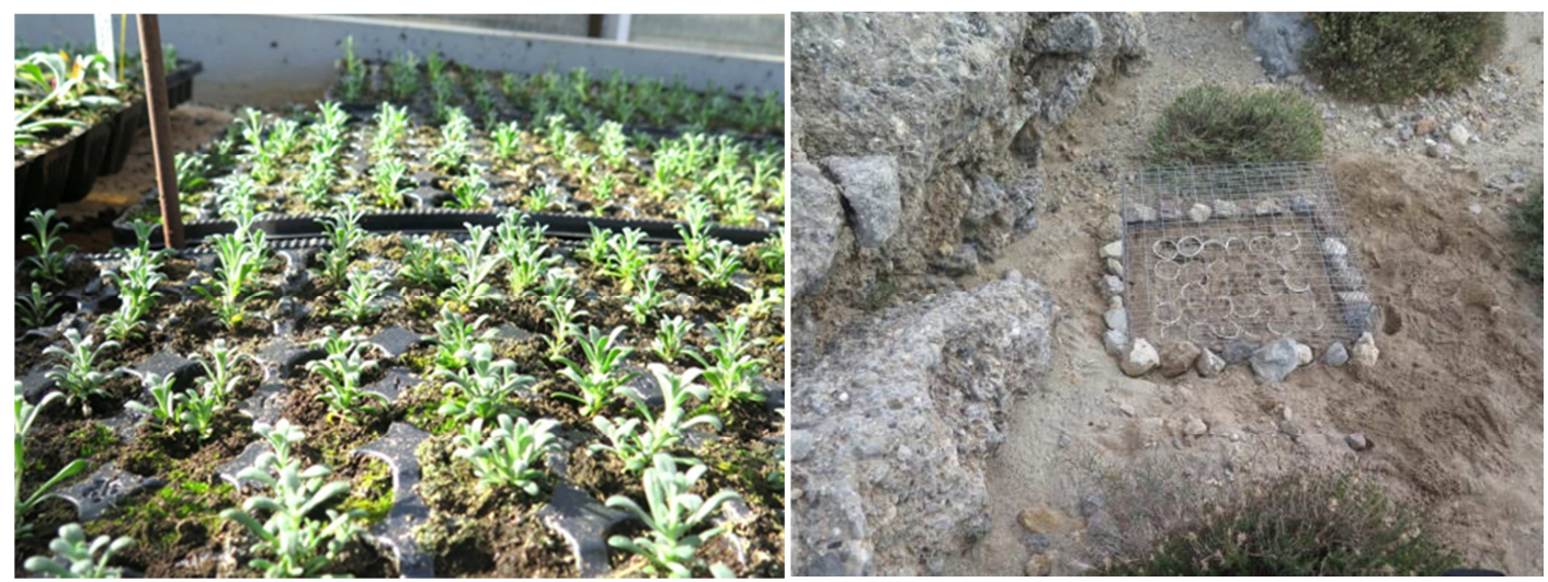
B. creutzburgii subsp. zaffranii seedlings at the greenhouse of MAICh & Seeds sown in paper pots and covered with protective structure