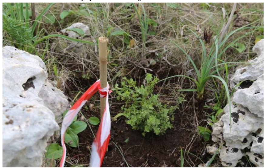
Translocated plant of Origanum onites (N.R. Grotta Palombara, Syracuse)