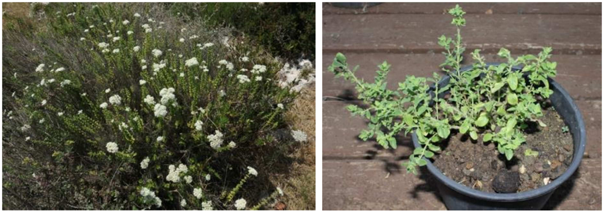
Left: Natural population of Origanum onites (Syracuse); Right: Juvenile plant of Origanum onites