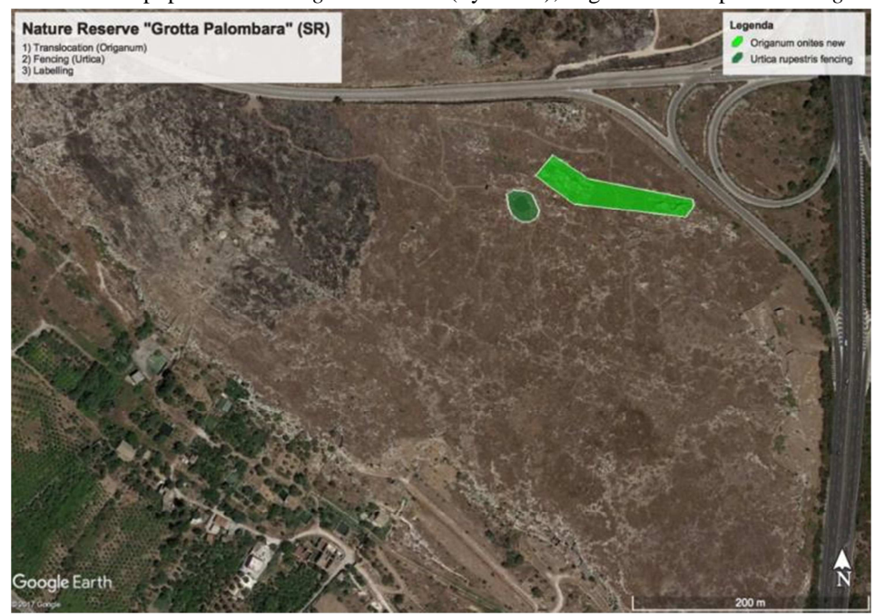
Localization of the new population of Origanum onites within the N.R. "Grotta Palombara