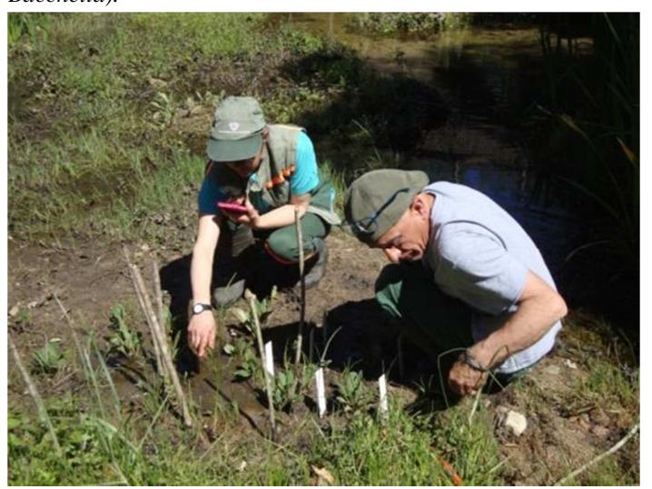
Translocation of Senecio morisii