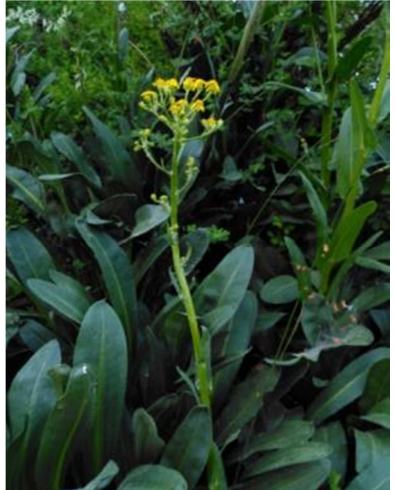
Left: Flowering of Senecio morisii. Right: Individual of Senecio morisii.